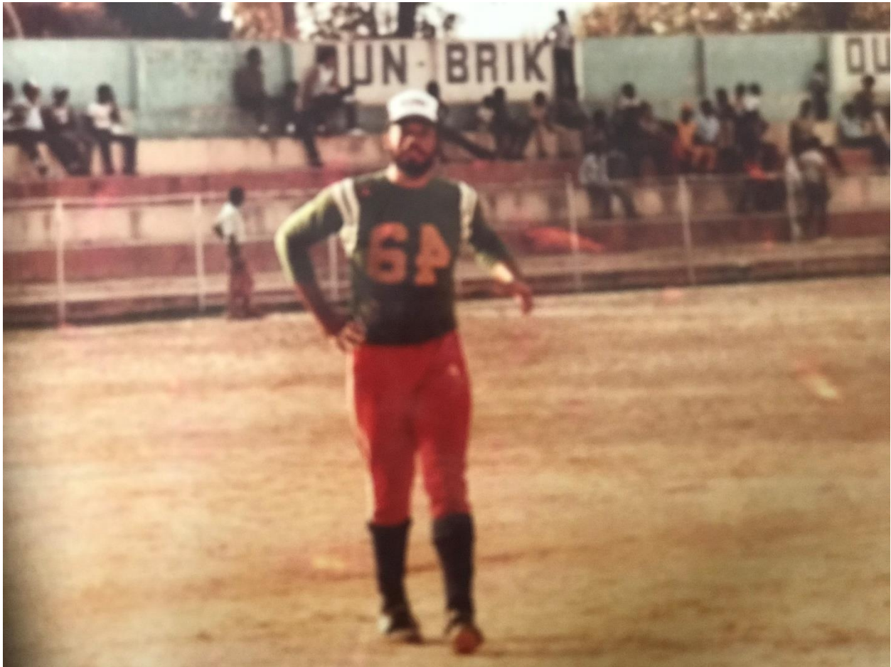
After Playing a Football game in Montreal, Quebec during late 60's.

I grew up in Montreal PQ and we learned the rudiments of the game while being a student at the Bourget College in Rigaud. The game was similar but showed some differences in the rules, The ball was larger and more difficult to handle. The same changes pertinent to the game was seen in the Canadian league as well, Football fever in Washington DC was significant during my years of residency in General Surgery and Orthopedics at Howard, I was a Dallas fan and Tony Dorsett, Randall Cunningham etc competed well with Joe Theisman and Riggs, the locomotive. We will not be able to argue about statistics in the present moment.