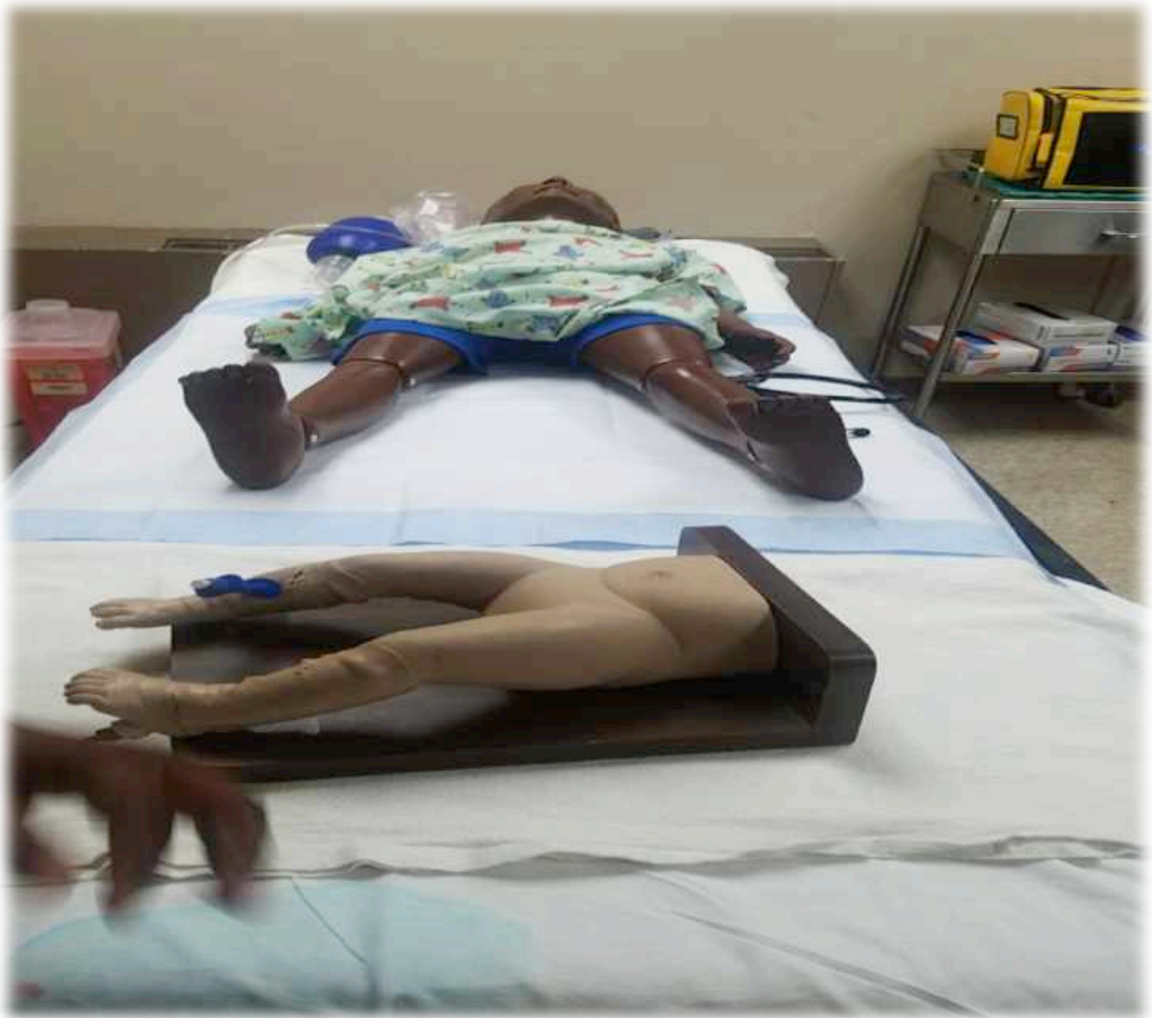
Models in the simulation Lab