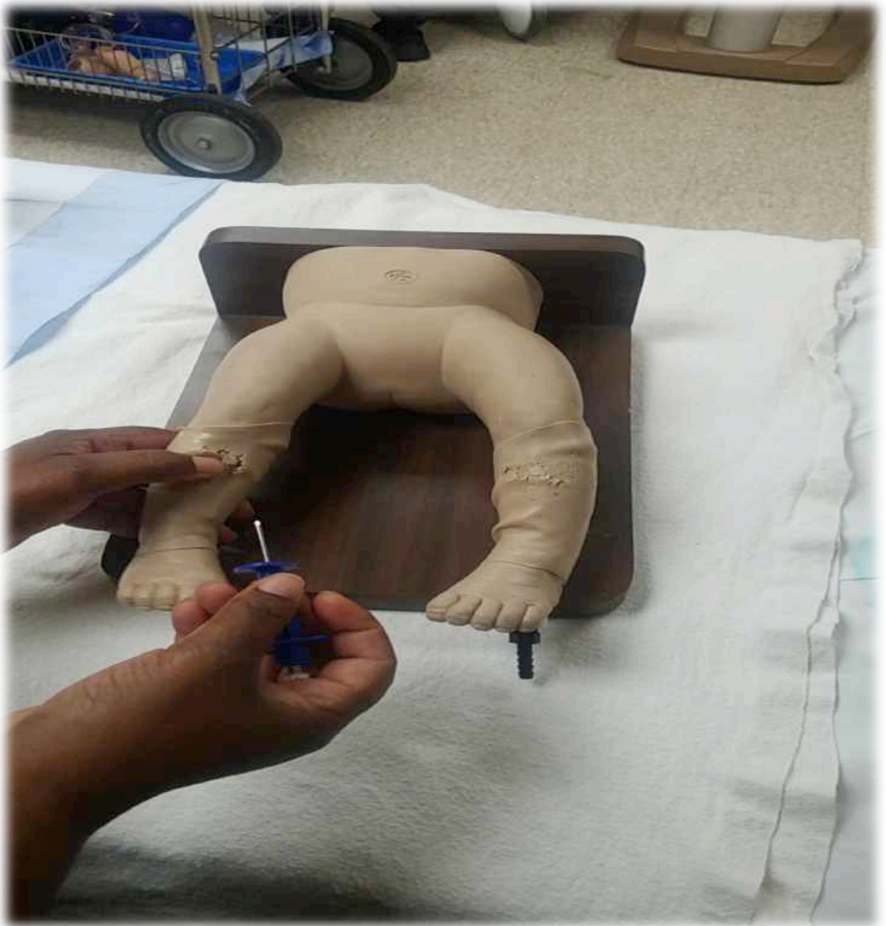
Model in the simulation Lab for Intraosseus access